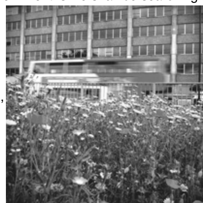
Central reservation wildflower patch

People wanting to take part, or contribute to Urban Buzz can get in touch with Nick Packham, the Urban Buzz Conservation officer: Nick.Packham@buglife.org.uk Activities could include; helping to identify potential new sites, attending habitat creation days or assisting with basic monitoring.