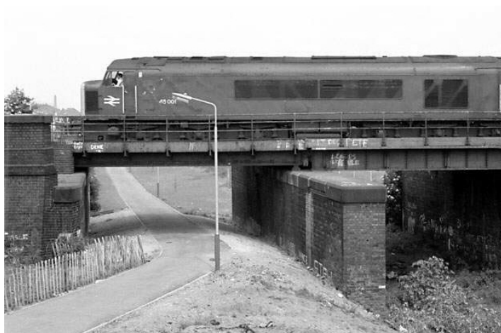
Users of the Great Central Way will recognise this bridge even with the changes in the immediate environment since photo taken