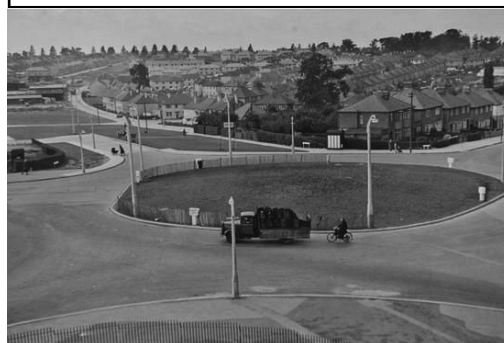
Pork Pie Island before the ring road was built